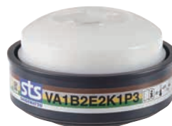
Multi-type Gas Filter

For Organic, Inorganic, Sulphur dioxide and other Acidic Gases & Vapours, Ammonia & Organic Ammonia derivatives, and Particles